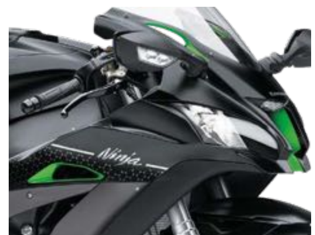
DISTINCTIVE GREEN HIGHLIGHTS (NINJA ZX-10R SE)