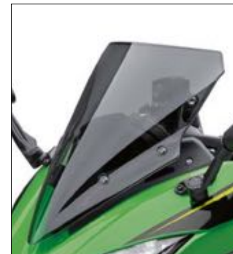
SMOKE AND LARGE SCREEN