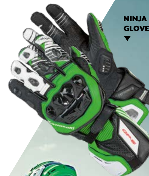
NINJA LEATHER GLOVES ▼