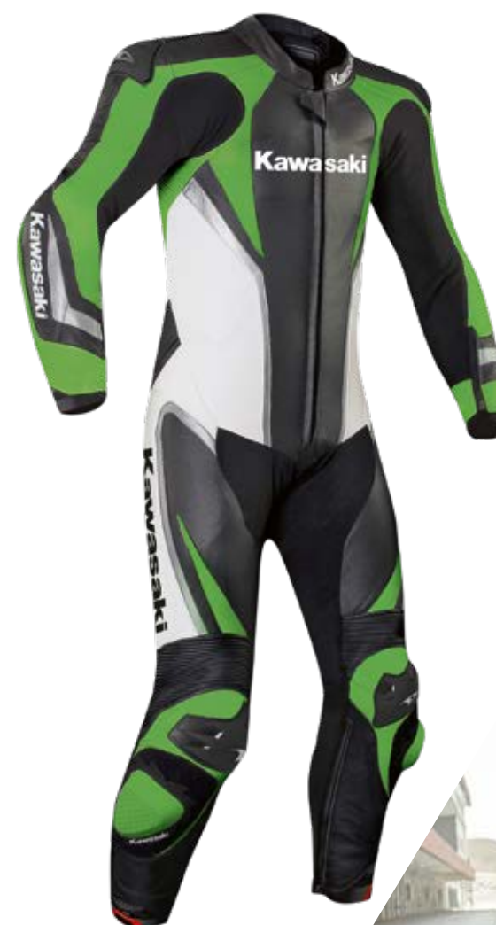
LEATHER SUIT ▲

Be prepared for any riding situation with our stylish range of riding gear. Made from the highest quality materials, our hard wearing clothing accessory range will never let you down. See the whole range at www.kawasaki.eu/accessories