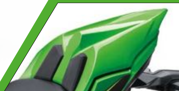
PILLION SEAT COVER