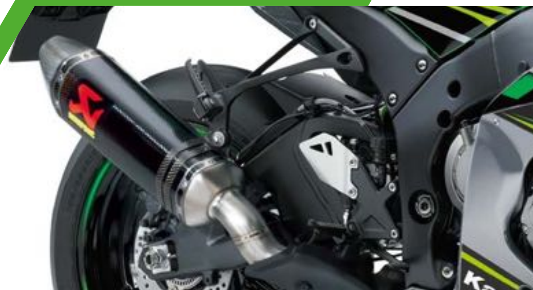
AKRAPOVIČ CARBON SILENCER