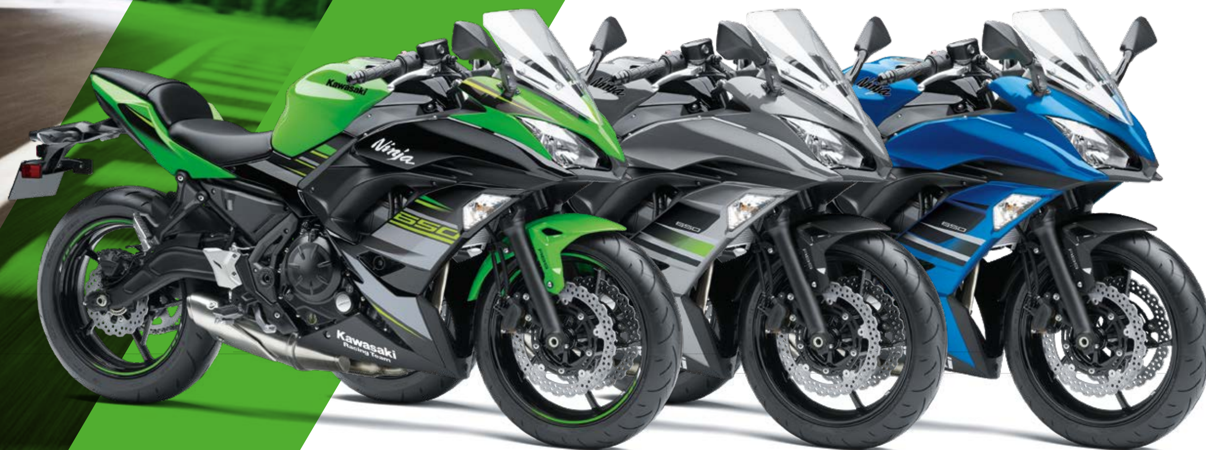
LIME GREEN / EBONY (KRT EDITION)