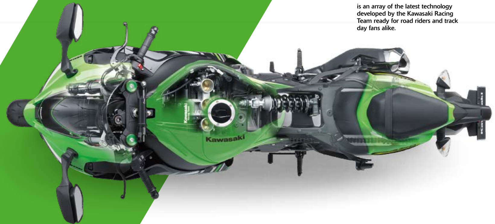
NINJA ZX-10R SE

is an array of the latest technology developed by the Kawasaki Racing Team ready for road riders and track day fans alike.