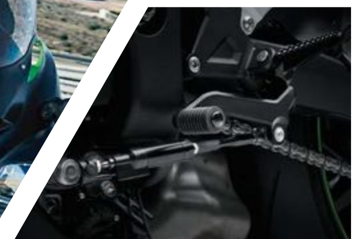
DUAL DIRECTION KAWASAKI QUICK SHIFTER (NINJA ZX-10R SE AND RR)