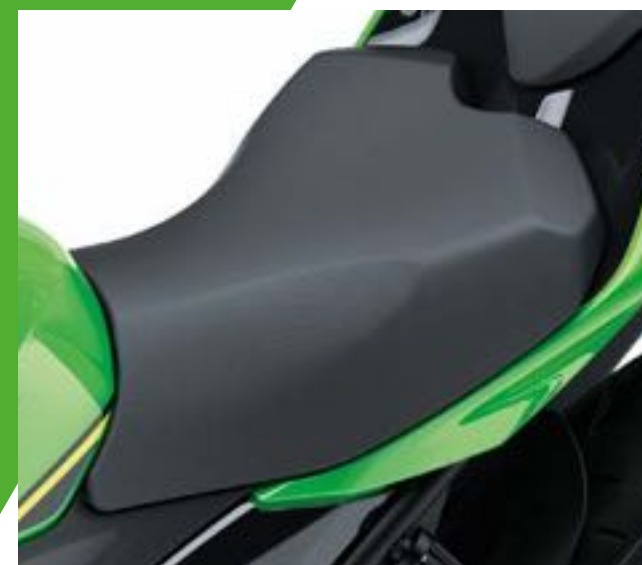
ERGO-FIT HIGH SEAT (+30 MM)