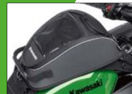
4L TANK BAG