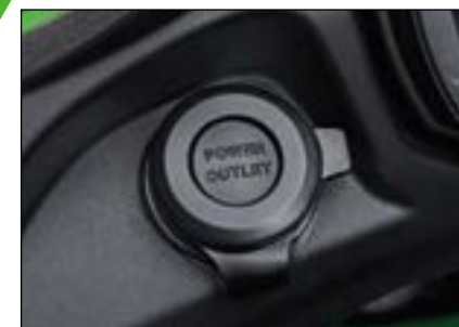
12V POWER OUTLET