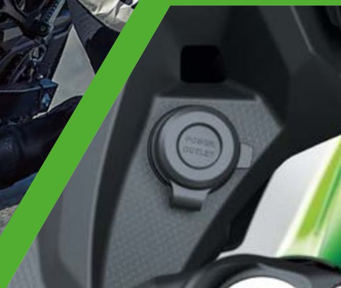
12V POWER OUTLET