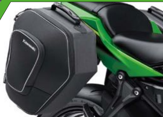
28L SEMI-SOFT PANNIER SET