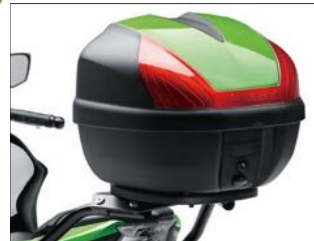
30L TOP CASE