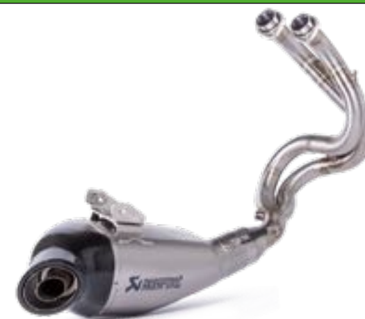
AKRAPOVIČ TITANIUM EXHAUST