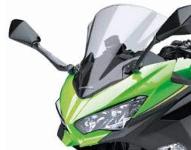
LARGE SCREEN - SMOKE OR CLEAR