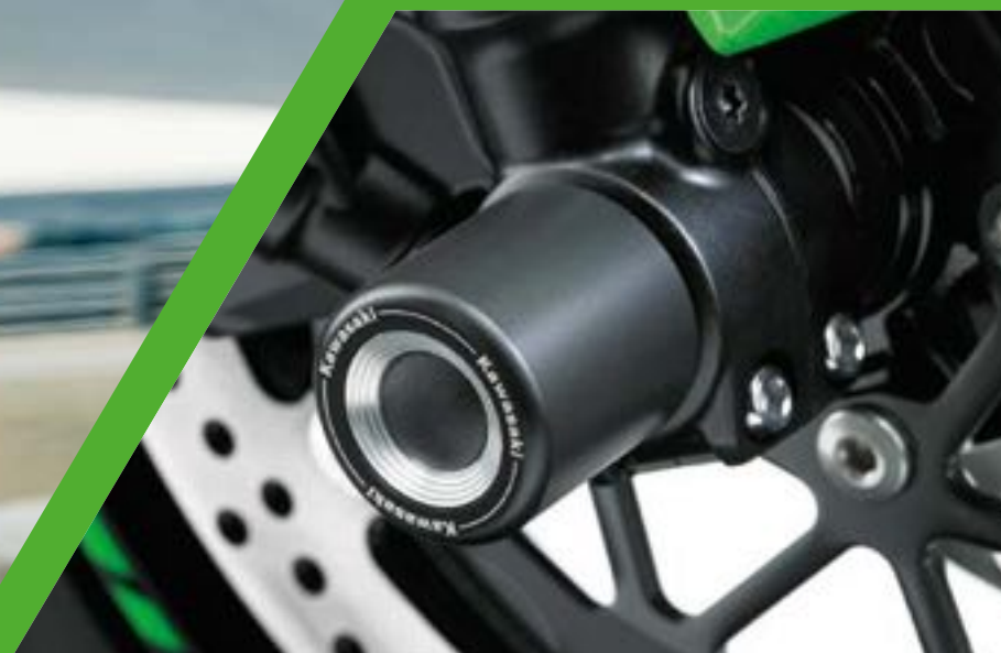
FRONT AXLE PROTECTOR