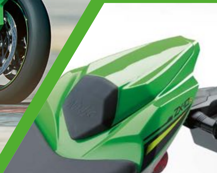
PILLION SEAT COVER