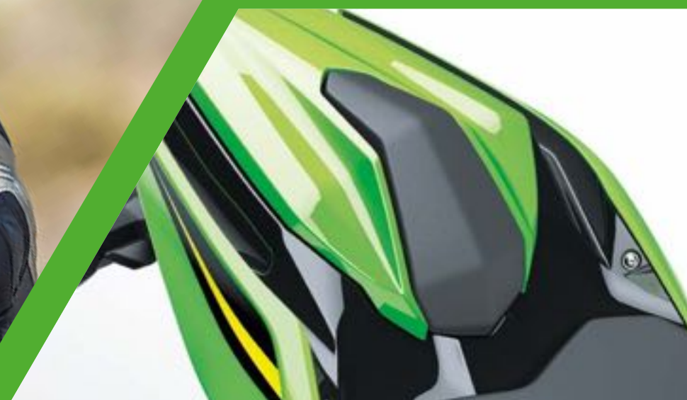
PILLION SEAT COVER