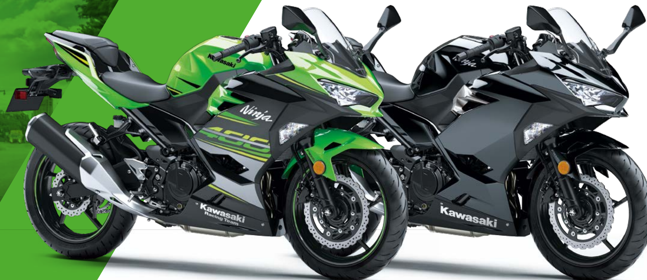
LIME GREEN / EBONY (KRT EDITION)