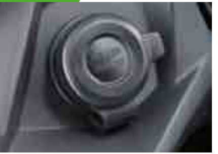
12V POWER OUTLET