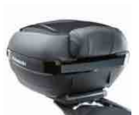
PILLION BACK REST