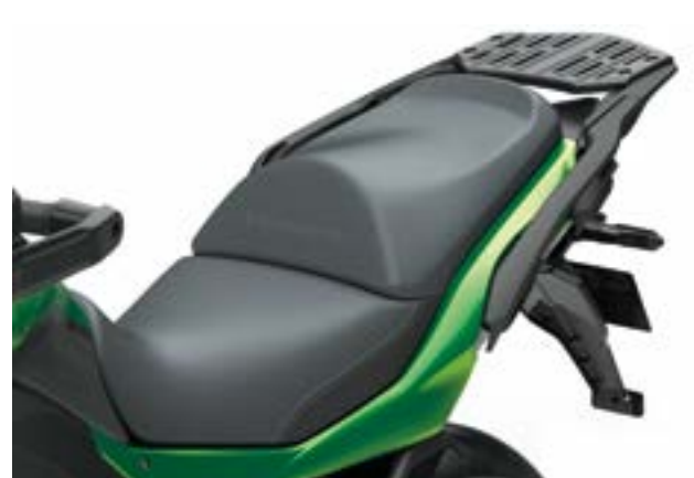
ERGO-FIT 20 MM LOWER SEAT