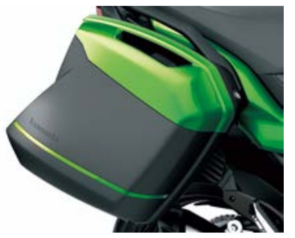
56L COLOUR CODED, ONE-KEY PANNIER SYSTEM