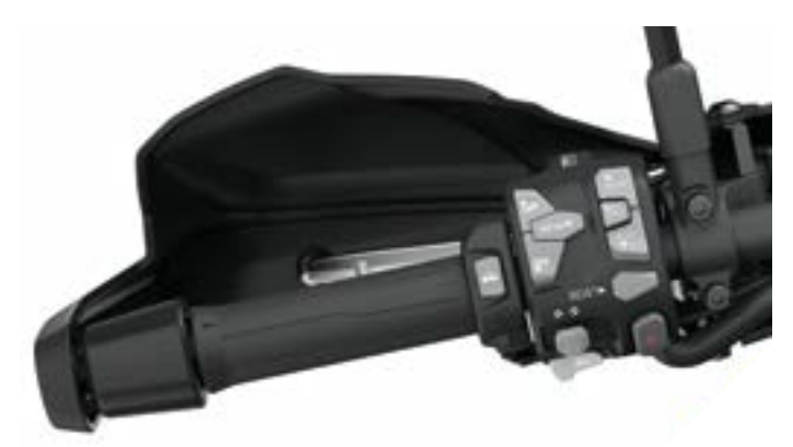
GRIP HEATERS (STANDARD ON SE)