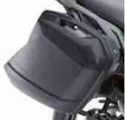
56L PANNIER SYSTEM