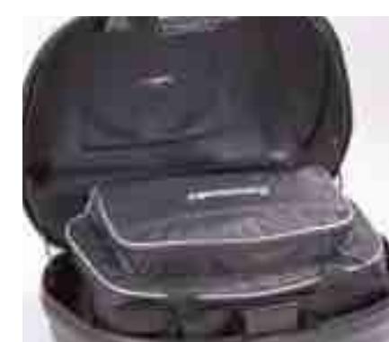
INNER BAG TOP CASE