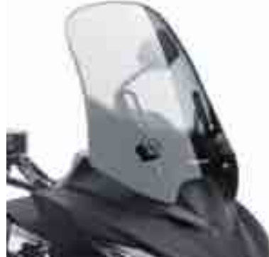
SMOKE SCREEN HIGH