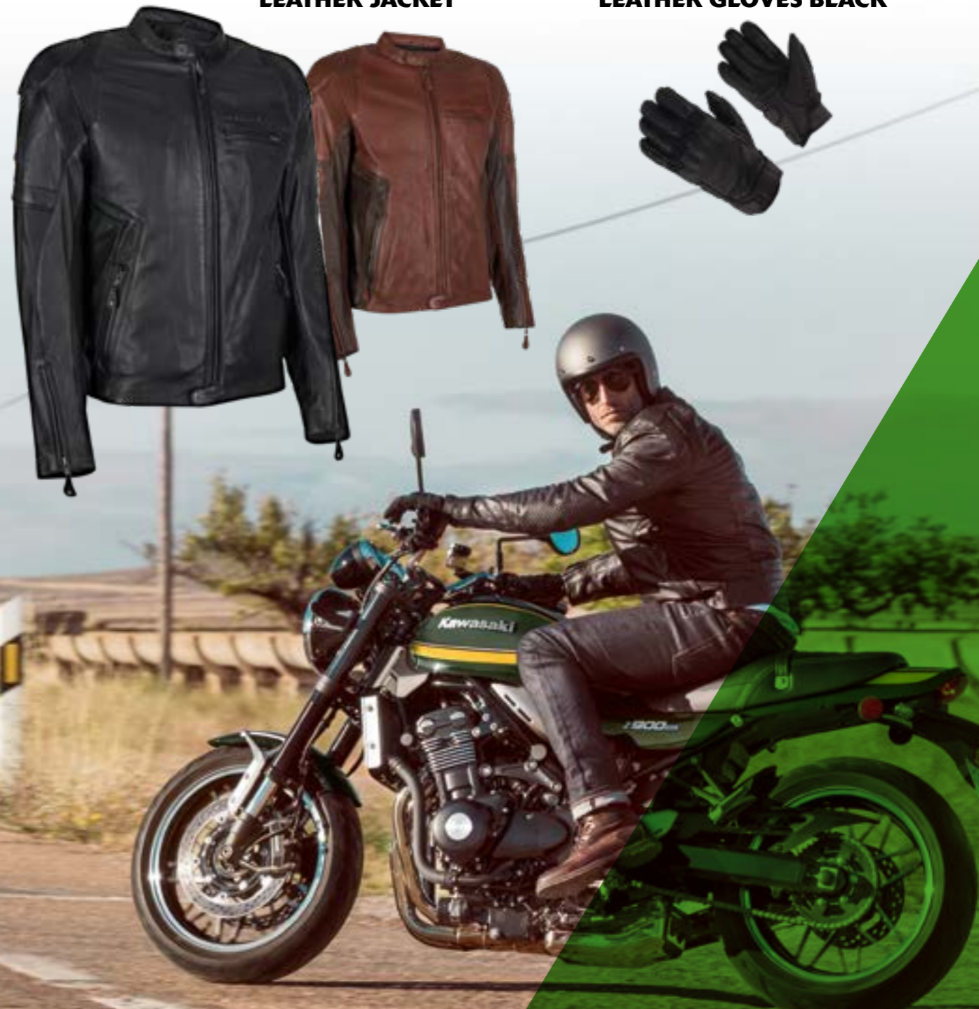
KAWASAKI RS BLACK LEATHER GLOVES BLACK