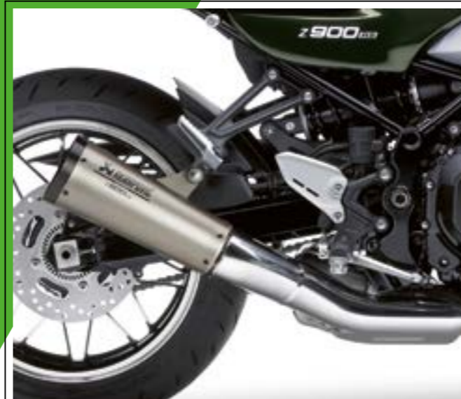
TITANIUM AKRAPOVIČ SILENCER