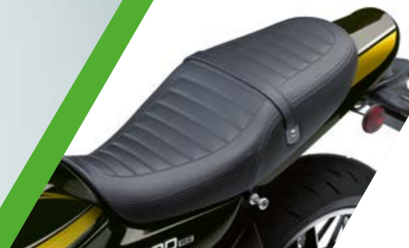
ERGO-FIT LOW SEAT