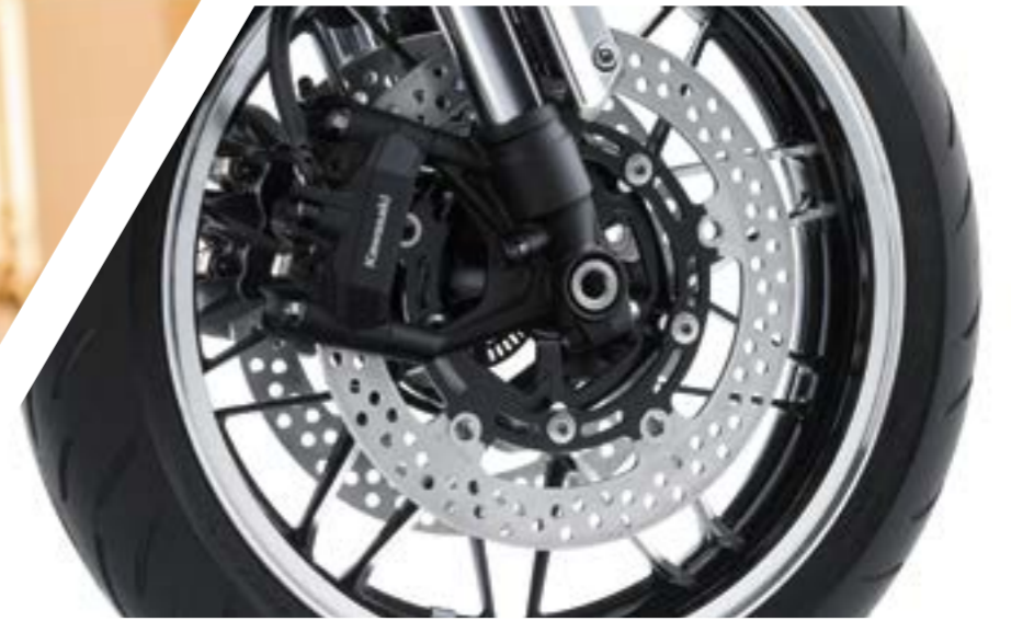
OPPOSED 4-PISTON RADIAL-MOUNT MONOBLOC CALIPERS