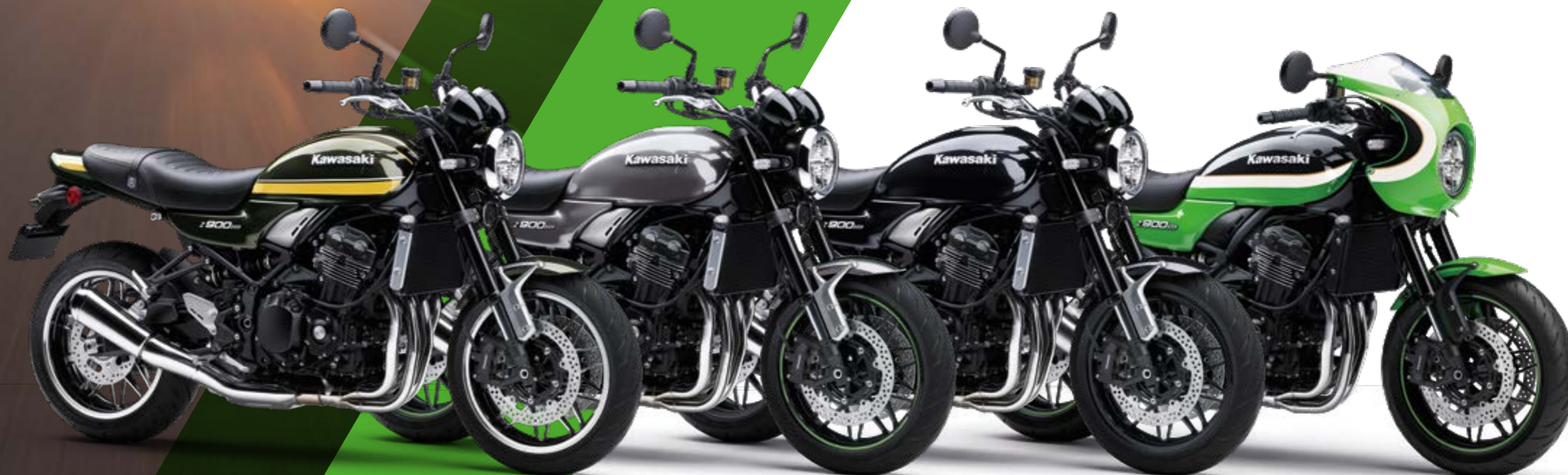
NEW METALLIC GREEN