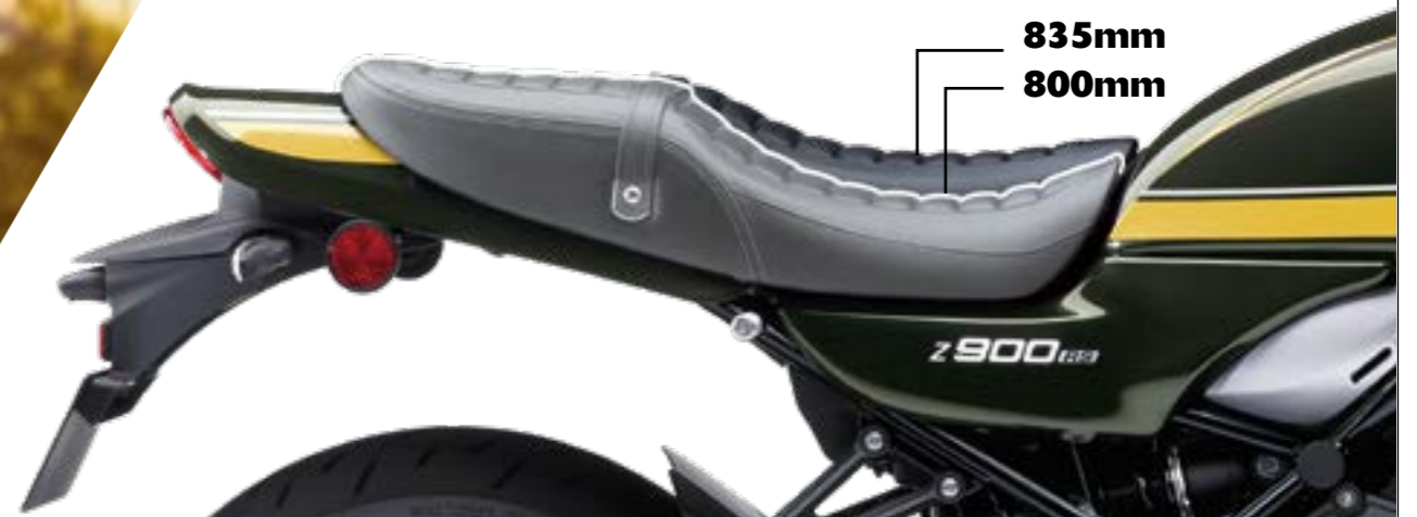
ERGO-FIT LOW-SEAT (OPTIONAL ON Z900RS)