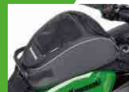
4L TANK BAG