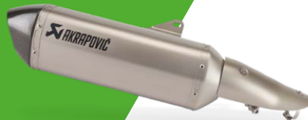
TITANIUM AKRAPOVIČ SILENCER