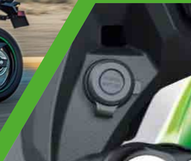
12V POWER OUTLET