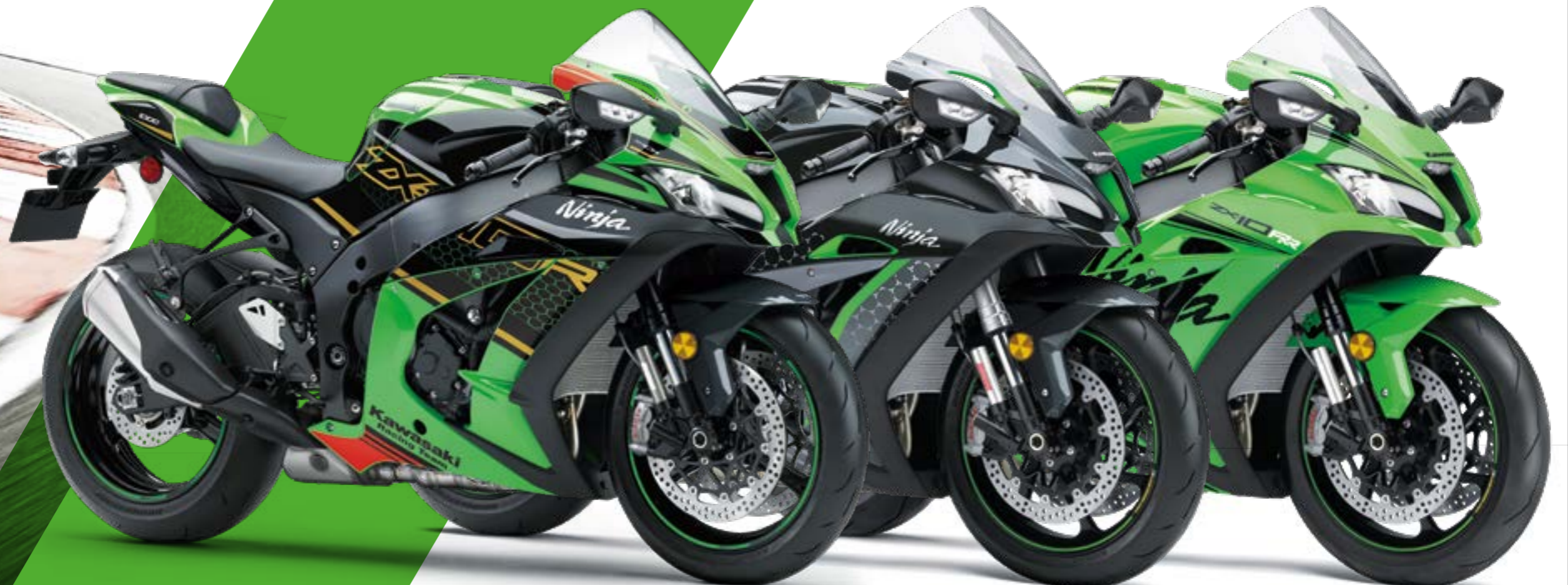
LIME GREEN / EBONY (KRT EDITION)