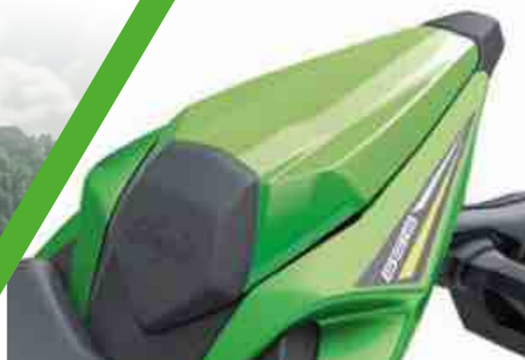
PILLION SEAT COVER