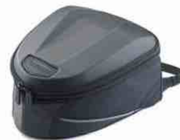
REAR SOFT CASE