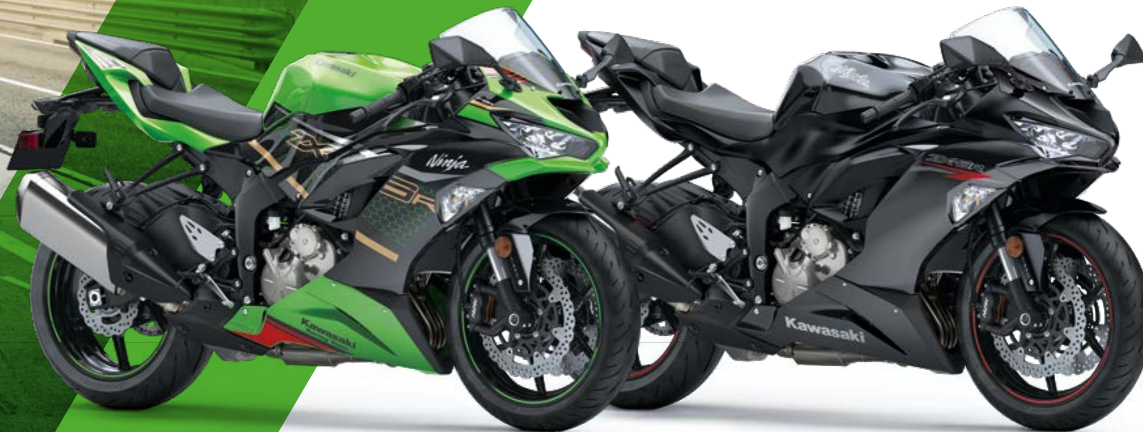
LIME GREEN / EBONY (KRT EDITION)