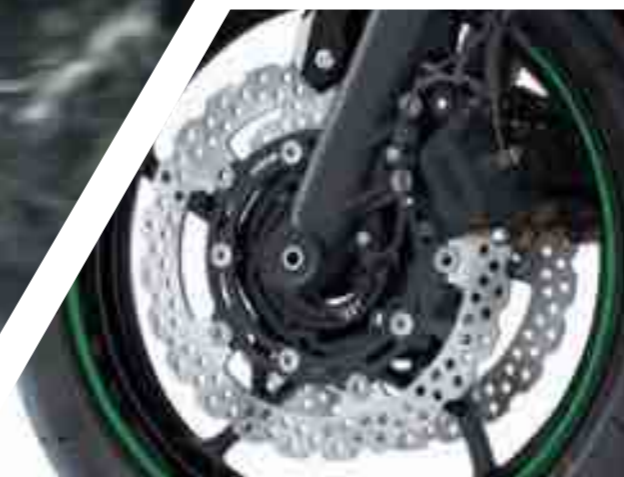
DUAL PISTON CALIPERS, PETAL DISCS