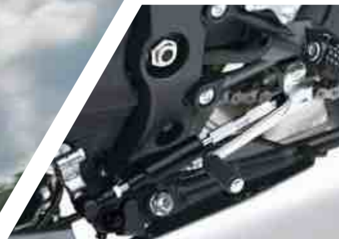
KQS (KAWASAKI QUICK SHIFTER)