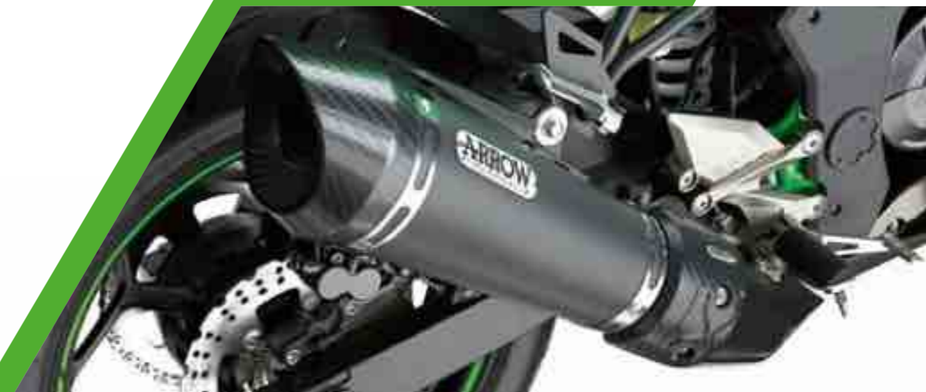
ARROW SILENCER WITH CARBON HEAT SHIELD