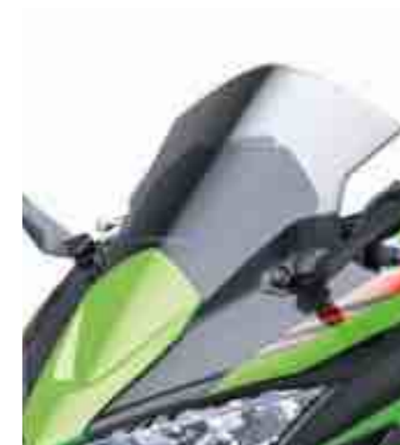
SMOKE AND LARGE SCREEN