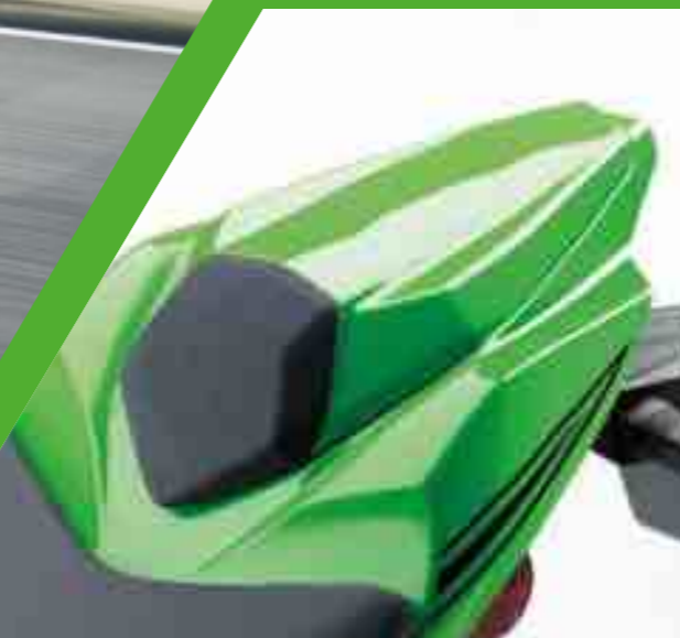
PILLION SEAT COVER