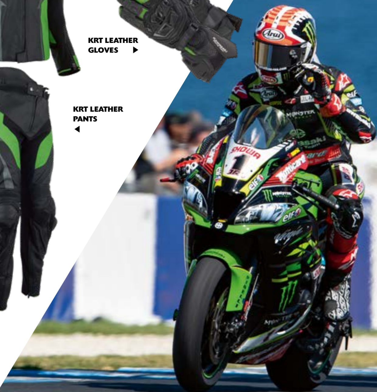
KRT LEATHER PANTS