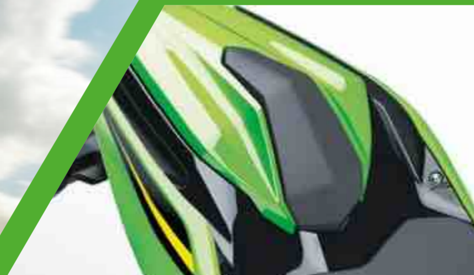
PILLION SEAT COVER