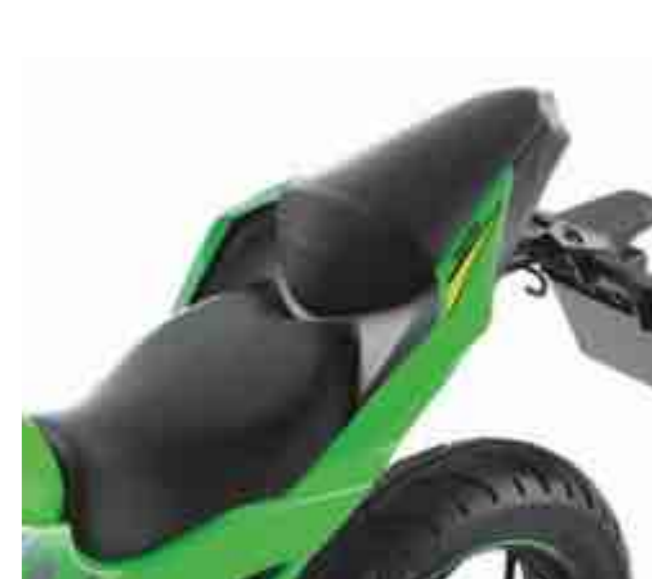
ERGO-FIT HIGH SEAT (+20MM)