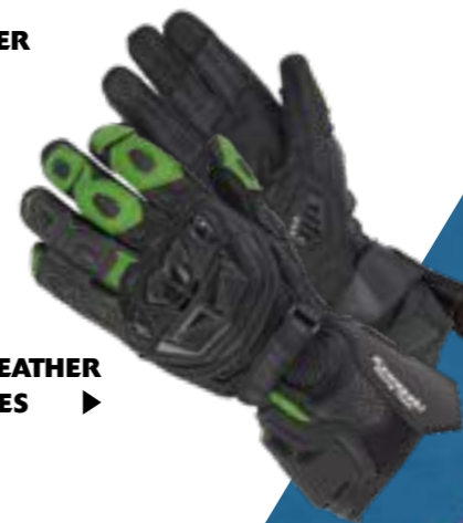
KRT LEATHER GLOVES