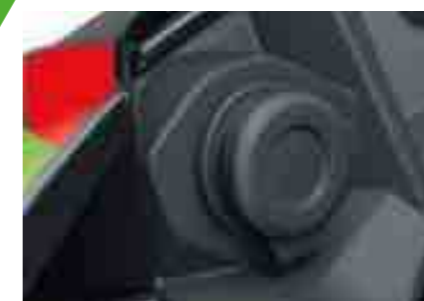
12V POWER OUTLET