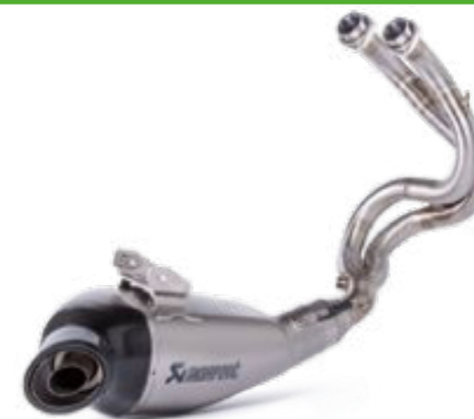
AKRAPOVIČ TITANIUM EXHAUST