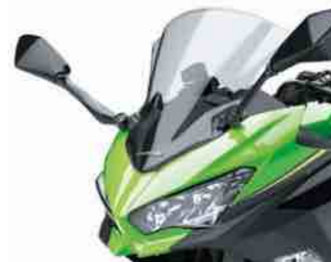
LARGE SCREEN - SMOKE OR CLEAR