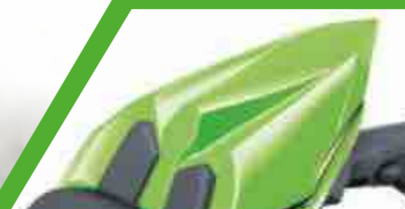
PILLION SEAT COVER