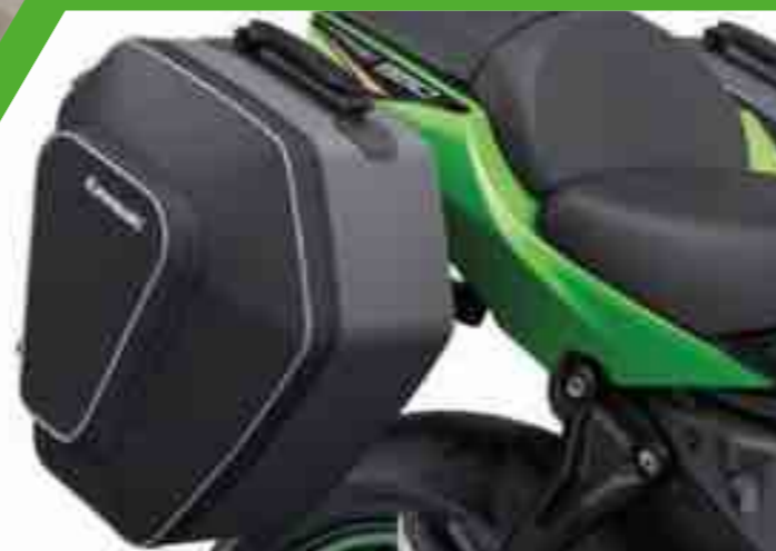
28L SEMI-SOFT PANNIER SET