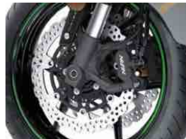
LARGE BRAKE DISCS, MONOBLOC CALIPERS