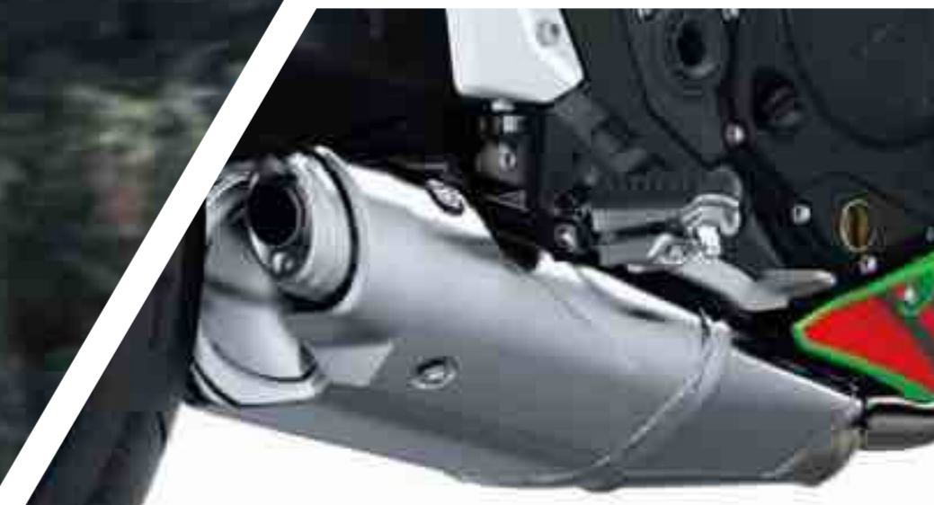
ATTRACTIVE UNDER-ENGINE SILENCER