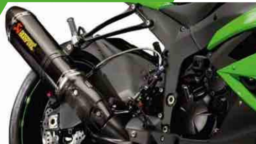
AKRAPOVIČ CARBON SILENCER