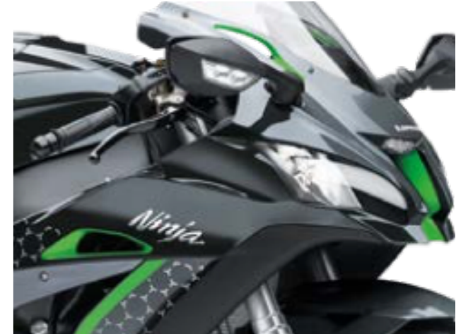
DISTINCTIVE GREEN HIGHLIGHTS (NINJA ZX-10R SE)