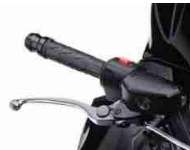
5-WAY ADJUSTABLE CLUTCH AND BRAKE LEVER