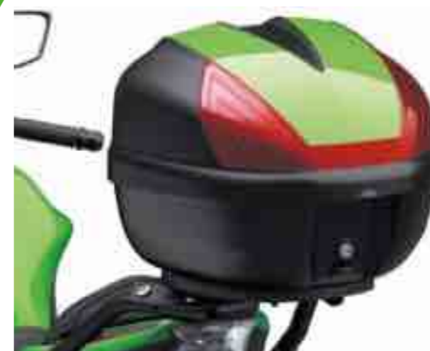
30L TOP CASE