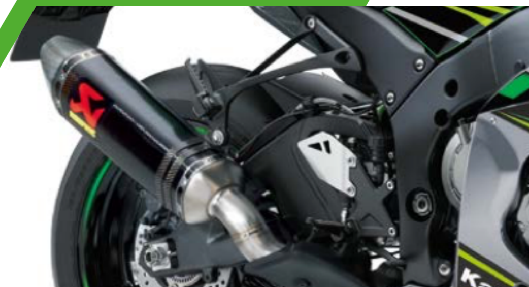
AKRAPOVIČ CARBON SILENCER