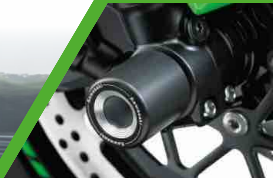
FRONT AXLE PROTECTOR