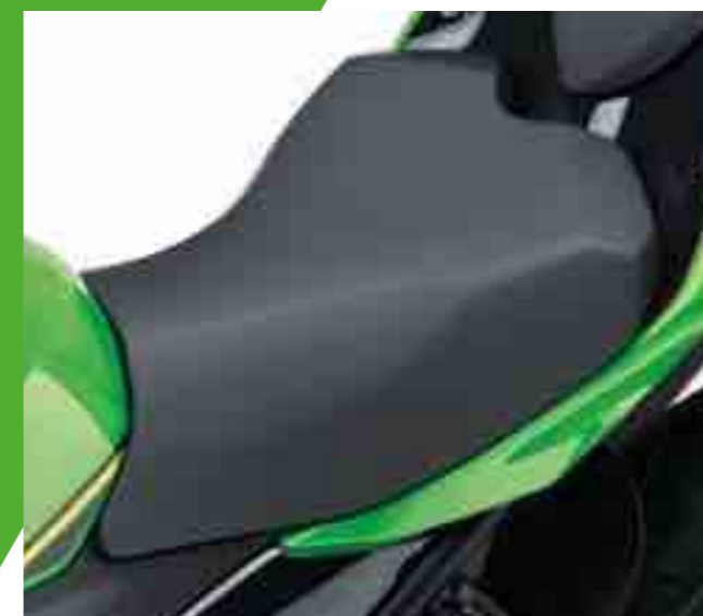
ERGO-FIT HIGH SEAT (+30 MM)