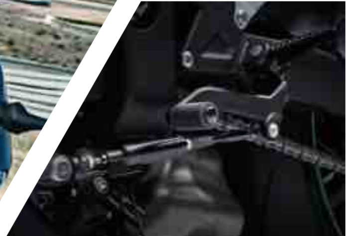
DUAL DIRECTION KAWASAKI QUICK SHIFTER (NINJA ZX-10R SE AND RR)