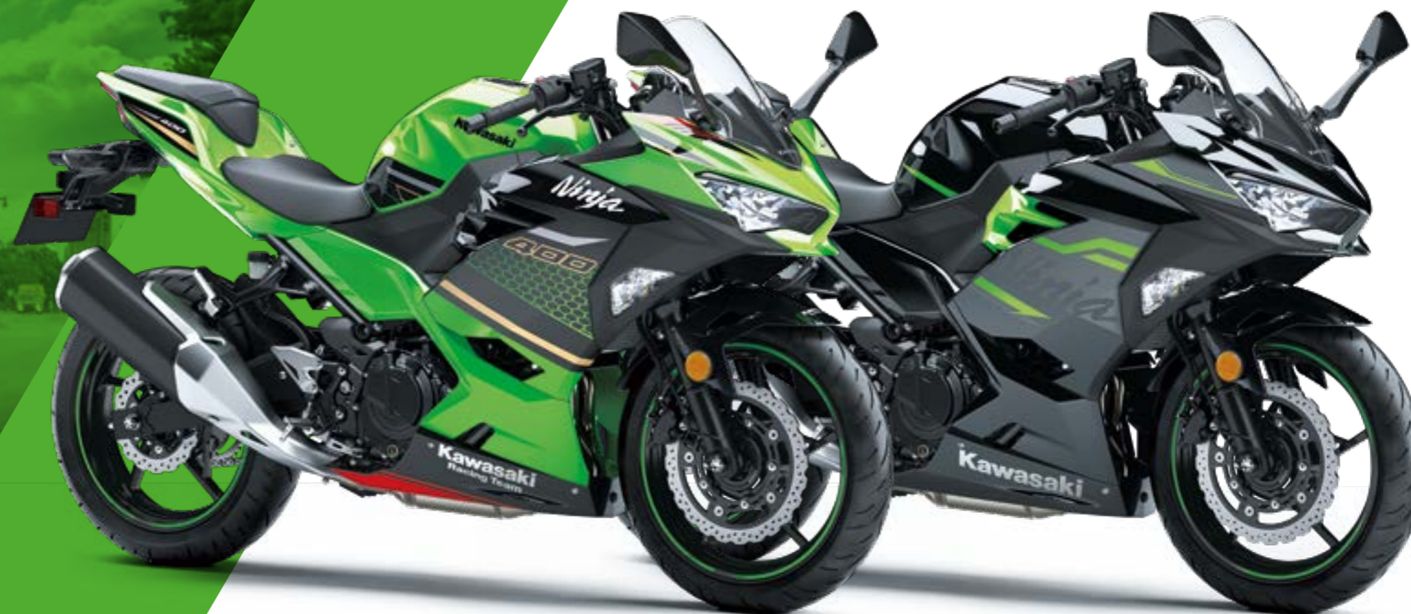
LIME GREEN / EBONY (KRT EDITION)