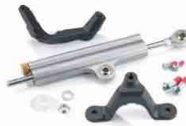
STEERING DAMPER KIT