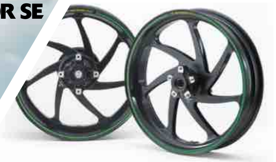
7-SPOKE MARCHESINI FORGED WHEELS (NINJA ZX-10R SE AND RR)