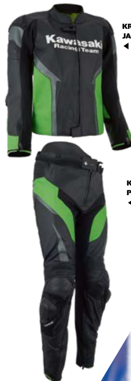
KRT LEATHER JACKET

Be prepared for any riding situation with our stylish range of riding gear. Made from the highest quality materials, our hard wearing clothing accessory range will never let you down. See the whole range at www.kawasaki.eu/accessories