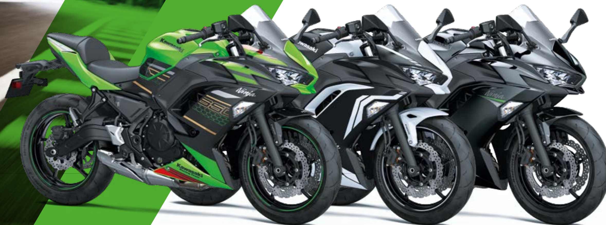
LIME GREEN / EBONY (KRT EDITION)