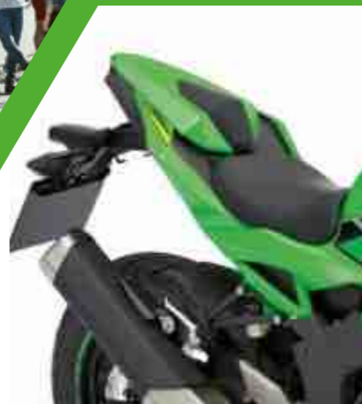
PILLION SEAT COVER