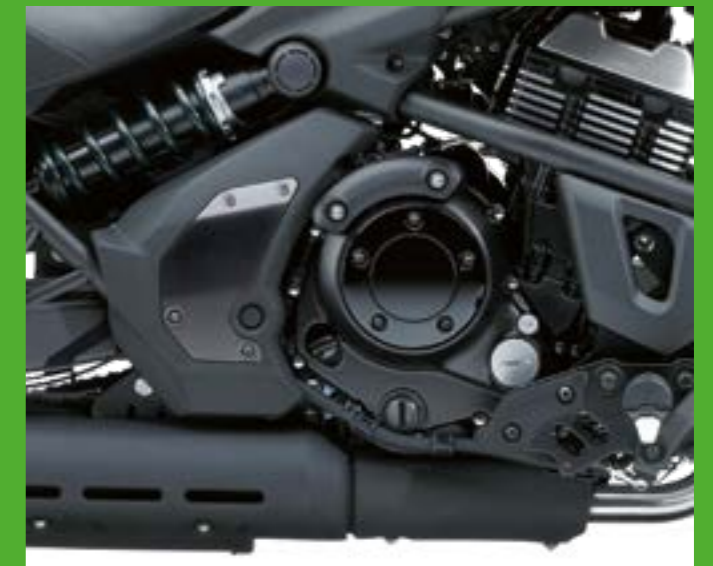
CLUTCH COVER PLATE