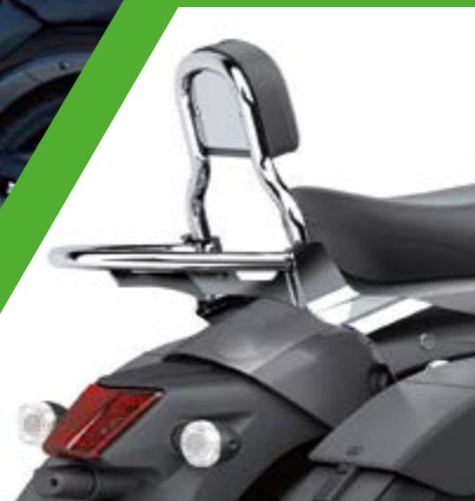
LUGGAGE RACK AND BACK REST