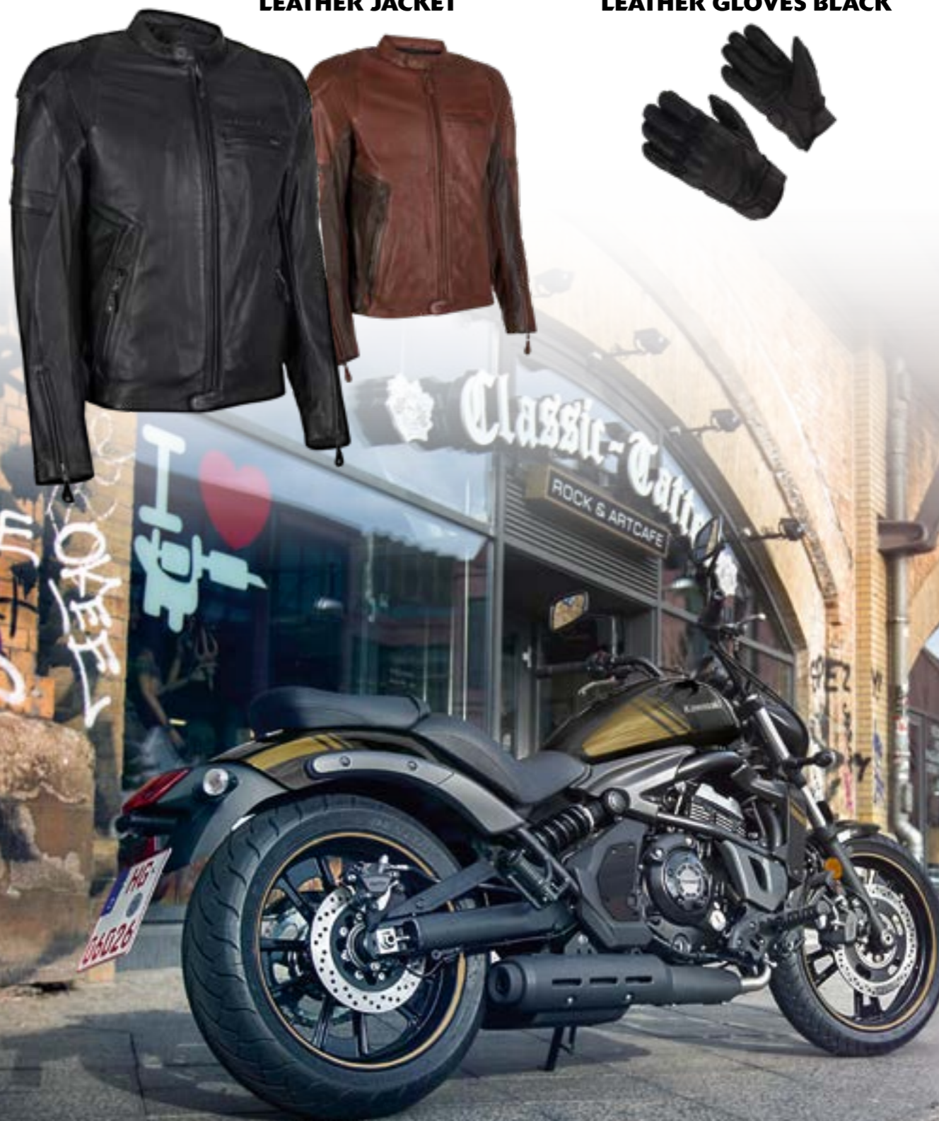
KAWASAKI RS BLACK LEATHER GLOVES BLACK