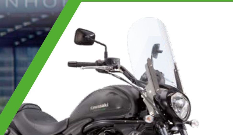
LARGE OR MEDIUM WINDSHIELD