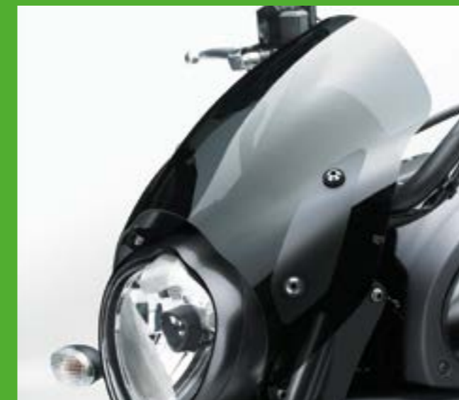
CAFE DEFLECTOR SCREEN