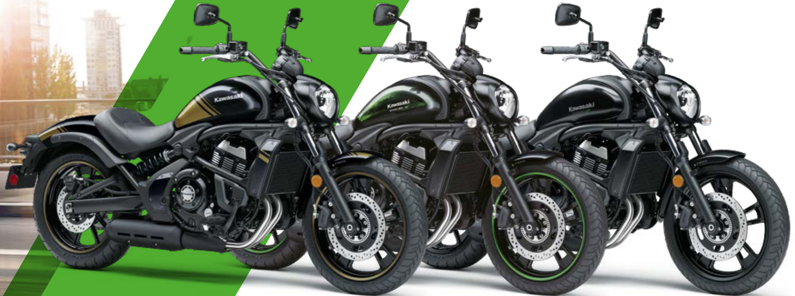
METALLIC SPARK BLACK GOLD STRIPES