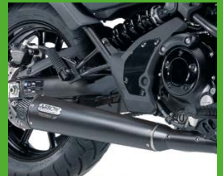
ARROW SPORTS EXHAUST (FULL SYSTEM)