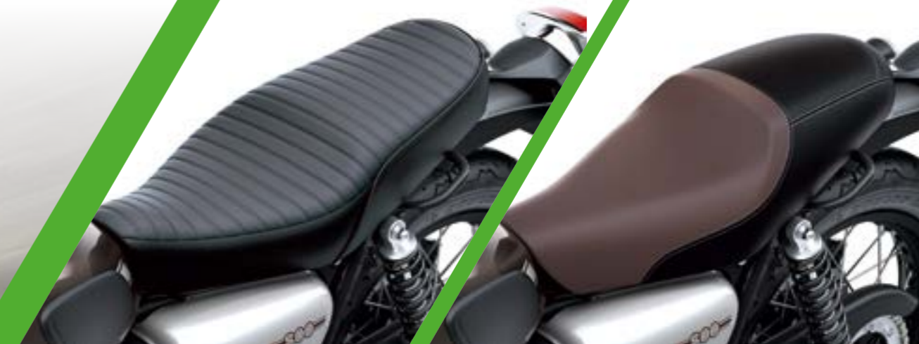
THE W800 SEATS ARE INTERCHANGEABLE, MAKING THE LOW-PROFILE STREET SEAT AND THE CAFE SEAT EASY OPTIONS FOR RIDERS LOOKING TO CUSTOMIZE THEIR RIDE.