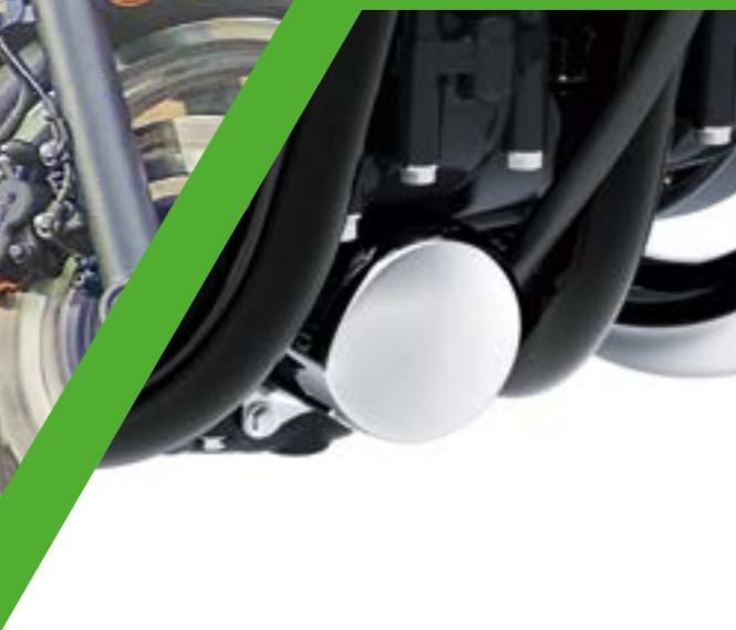
CHROME OIL FILLER COVER