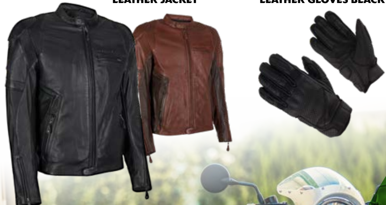
KAWASAKI RS BLACK LEATHER GLOVES BLACK