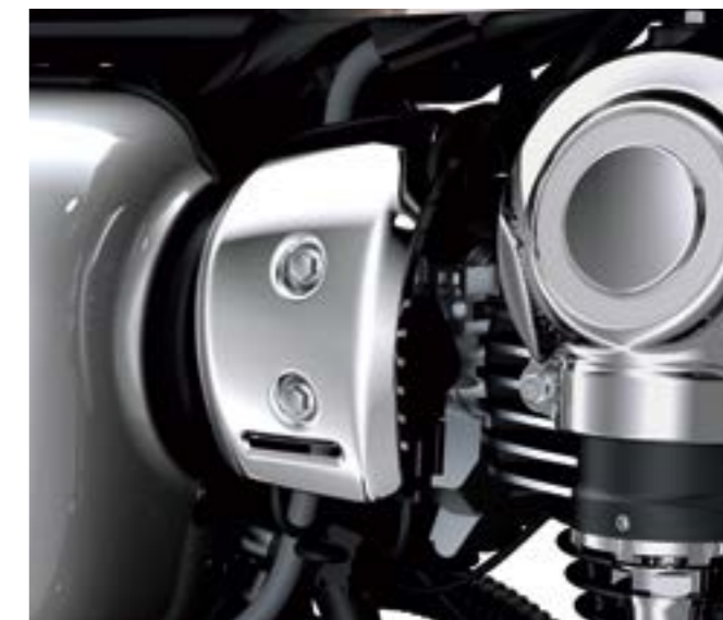
CHROME FI AND BEVEL GEAR COVERS