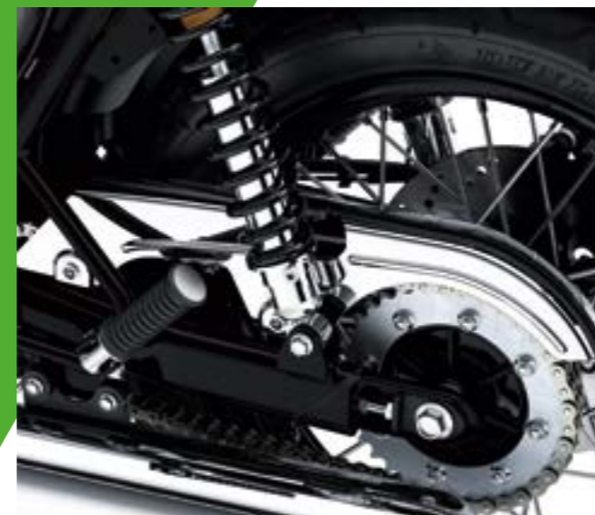
CHROME CHAIN COVER