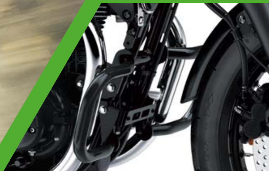
SMALL ENGINE GUARD