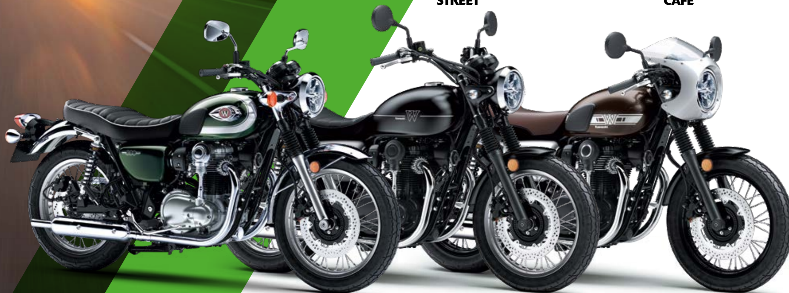
METALLIC DARK GREEN