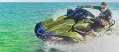
JETSKI ULTRA 310 LX