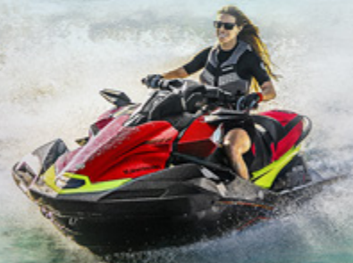
JETSKI ULTRA 310 X