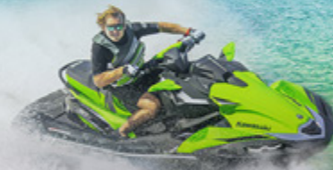
JETSKI ULTRA 310 LX S